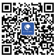
JLU Global QR Code